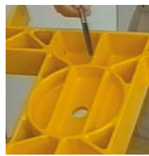
Chassis from ductile graphite iron