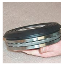
Ball bearing for turning plate