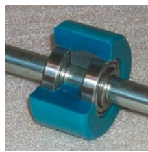
Rollers with ball bearing